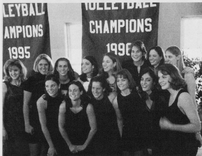
The 1997 Spartans, as seen at the volleyball banquet

The schedule for fall is pretty well set now (see back page). Notice that the alumni match is back after a two-year absence. At the midpoint of the Big Ten season, MSU and WMU may travel to the neutral site of Grand Rapids to play a special match for the fans in that area.